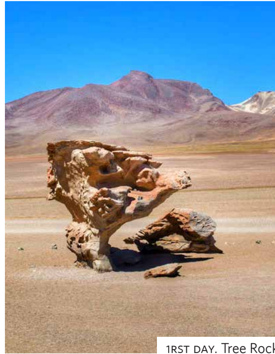
1ST DAY. Tree Rock.