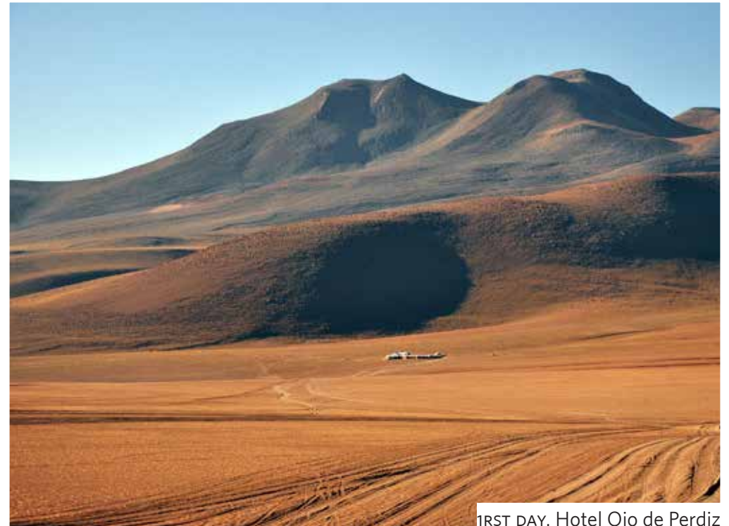
1ST DAY. Hotel Ojo de Perdiz