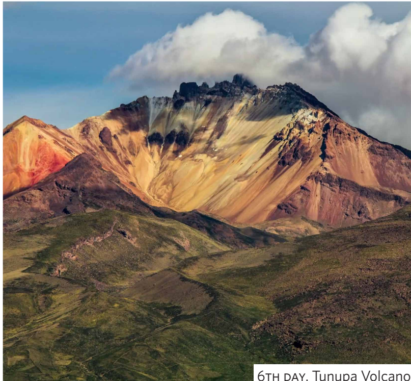
6TH DAY. Tunupa Volcano.