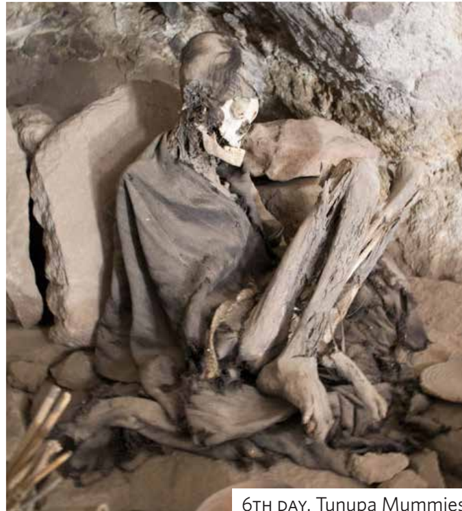
6TH DAY. Tunupa Mummies.