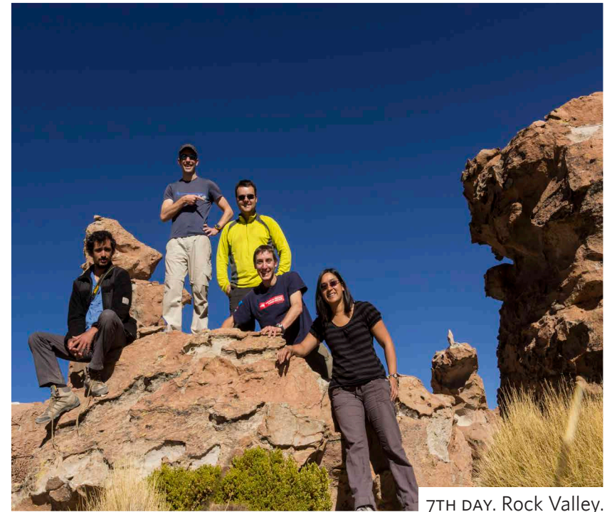
7TH DAY. Rock Valley.